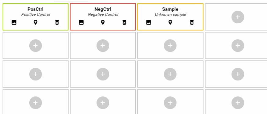
Fig 1. Cartridge set-up

The Kits may require the use of Taq Polymerase enzyme, DNA binding components and fluorochromes/quencher, often registered as trademark by companies. TaqMan® is a trademark of Roche Molecular Systems, Inc. FAM™, HEX™ and ROX™ are a trademark of Thermo Fisher Scientific or its subsidiaries. SYBR is a registered trademark of Molecular Probes, Inc. (Thermo Fisher Scientific). MGB probes are a trademark of Elitech group. The Kits have been internally tested by our quality control. Any responsibility is waived if the warranty of quality control does not refer to the specific Kits. The user is personally responsible for data that he/she will obtain and/or he/she will supply to third parties using these kits. Once the sealed package is opened the user accepts all the conditions without fail; if the package is still sealed the kit can be returned and the user can be refunded. Kits components are intended, developed, designed, and sold for Research Purpose Only. Product claims are subject to change. Therefore, please refer to our website (www.hyris.net) for the most up-to-date information on Hyris Ltd products.