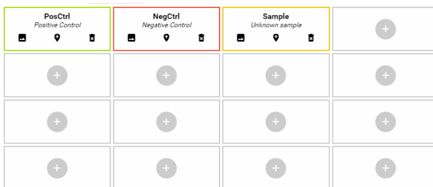
Fig 1. Cartridge set-up

An example of cartridge set-up on the bAPP for one replicate of a sample to be analyzed is shown.