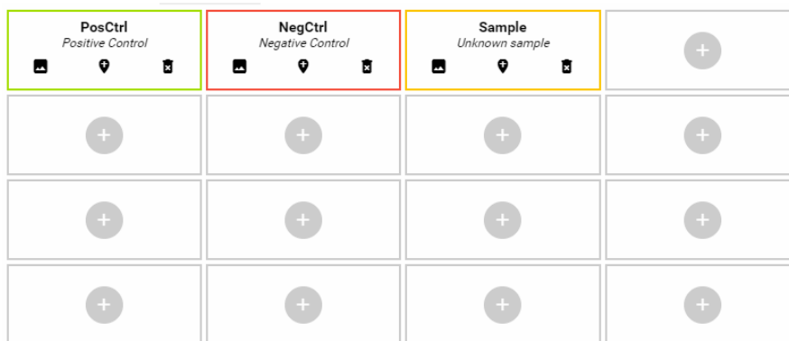
Fig. 1. Cartridge set-up

An example of cartridge set-up on the bAPP for one replicate of a sample to be analyzed is shown.