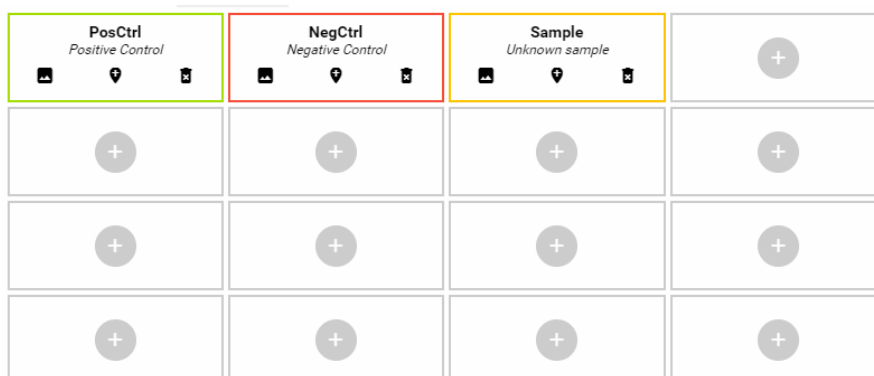
Fig 1. Cartridge set-up

An example of cartridge set-up on the bAPP for one replicate of a sample to be analyzed is shown.